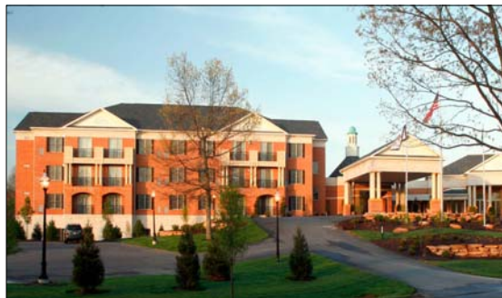
The Resort at Glade Springs, Daniels, W.Va.