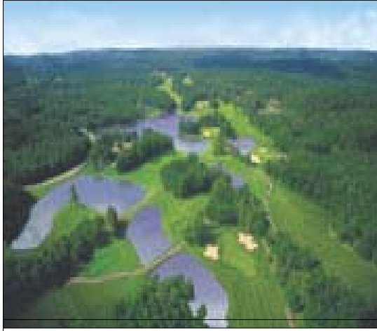
One of Glade Springs' golf courses

But the material will be made available to the WVHI membership.